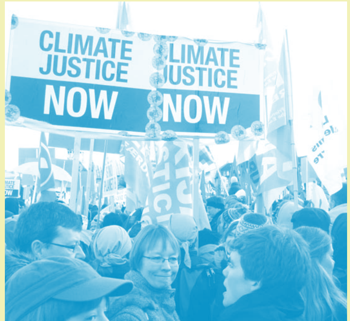
In Copenhagen on December 12, over 100,000 people marched in solidarity calling for climate justice.

There is still much work to be done. Without a firm footing on a path towards a binding global treaty in 2010, we turn our attention back to the debate in the U.S. Senate. In order for the United States